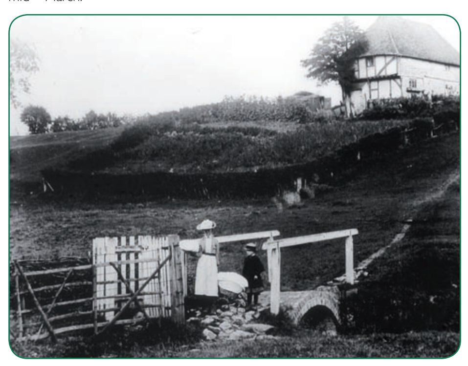
This photo of a bridge over the Lilk was taken around 1906 and shows Gore Cottage in the background.

A note to all donors - plaques with your names should be in place by mid - March.