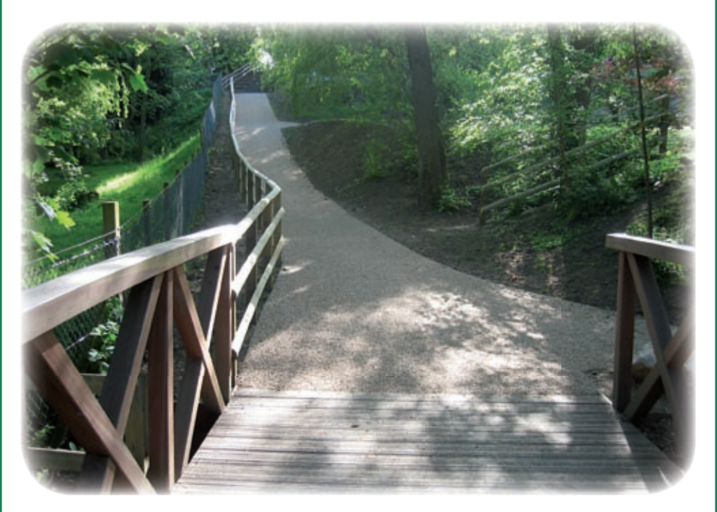
Transformation of access path to the new Lilk Valley Bridge at completion.